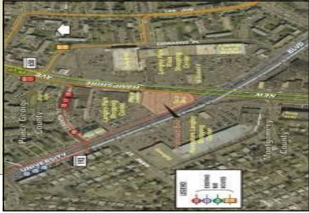
Langley/Takoma Park Transit Center Construction to start October 2006

The Ehrlich-Steele Administration announced plans to move full speed ahead on a Transit Center for the Takoma/Langley Crossroads community. The new Transit Center will be located along the alignment for the future Bi-County Transitway. The site of the Transit Center will be the northwest corner of the University Boulevard and New Hampshire Avenue intersection in Langley Park. The project is a joint effort between the Maryland Transit Administration (MTA) and the State Highway Administration (SHA) and will include pedestrian safety and intersection improvements with new sidewalks and crosswalks. The Crossroads is the busiest non-Metrorail transit hub in the region, with eleven different bus routes passing through this area. The bus stops are spread fairly far apart and riders transferring from one bus to another sometimes have to walk as much as 1,100 feet, and cross both